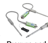
Pressure and Temperature at the Gate