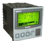
Temperature Control and Data logging