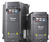
Adjustable Frequency Drive